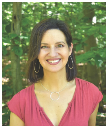
Permission to use author photo granted by HarperCollins. Biographical information courtesy Terri Libenson.

“There are a whole lot of books about kids who are outcasts. . . . It’s all good, but what about books starring other kinds of kids? . . . The ones who are maybe . . . heroes-in-waiting. And what if this “hero” isn’t picked on? What if the hero just goes . . . unnoticed?”